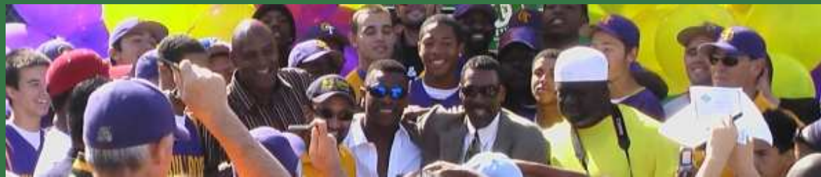
Rickey Henderson and Friends at the Field Dedication Ceremony, October 3, 2009

Securing the Site. The Committee obtained authorization from Oakland Unified School District (OUSD) to use the site for a new field, and OUSD subsequently contributed $60,000 toward the project. The Committee also partnered with the nonprofit